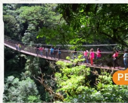
CANOPY AND HANGING BRIDGES IN THE VALLEY OF ANTON