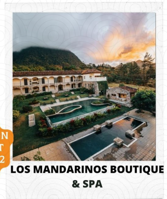
LOS MANDARINOS BOUTIQUE & SPA

$125.00 PER PERSON PER NIGHT MINIMUM 2 NIGHTS