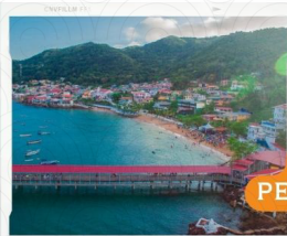
BEACH DAY AT TABOGA ISLAND