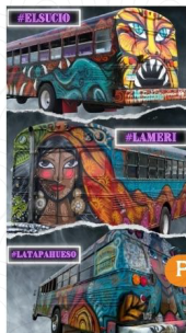
NIGHT PARTY CHIVA