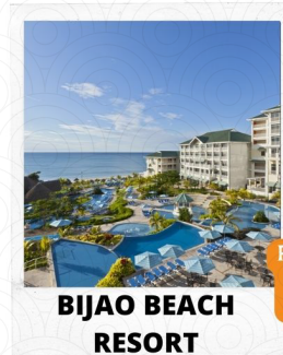
BIJAO BEACH RESORT

INCLUDES: 3 DAYS AND 2 NIGHTS, TRANSPORTATION TO AND FROM THE AIRPORT OR CITY