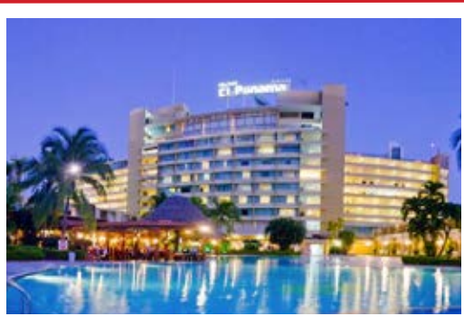
The Panama Hotel by Faranda Grand

Wyndham Panama Albrook Mall Hotel & Convention Center. Located adjacent to Albrook Mall, one of the largest international shopping malls, with variety of stores, amenities, supermarket, and food courts.